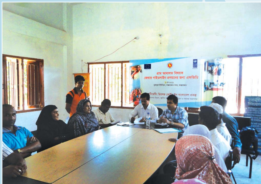
Training Manager of AVCB is at FGD in Cox's Bazar