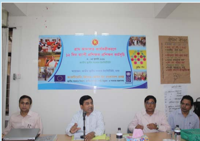
Guests are seen at ToT Program on Village Courts at NILG, Dhaka