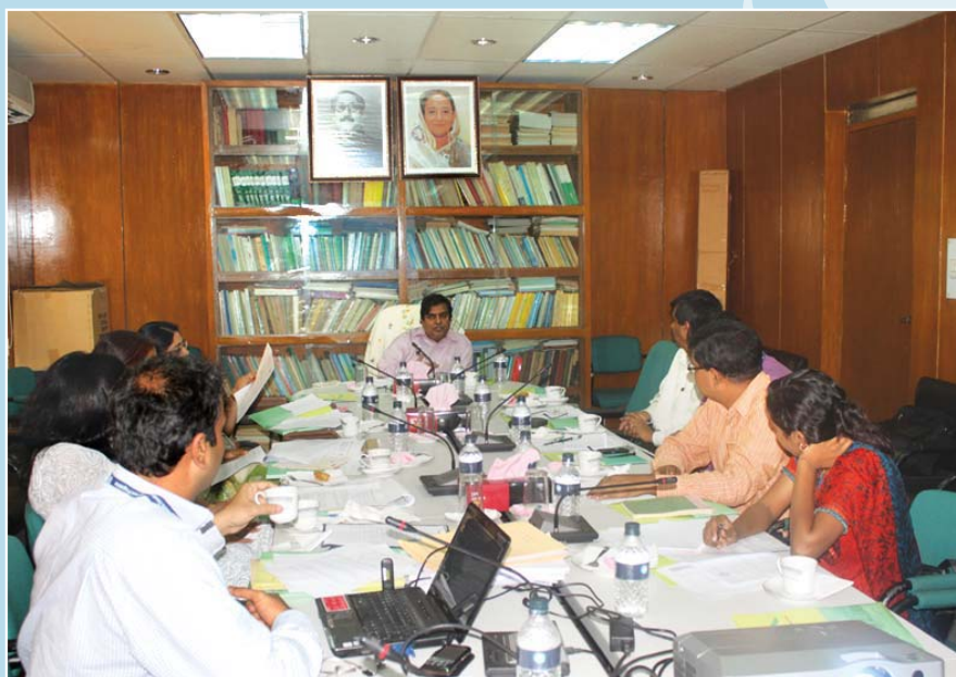
PIC Meeting is going on