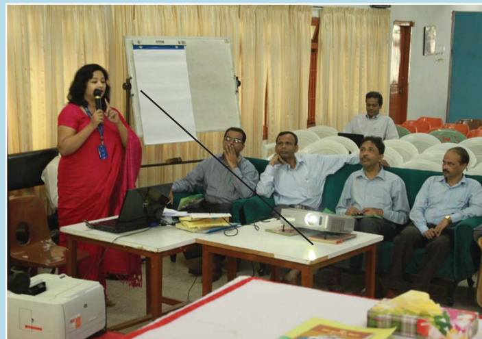
Workshop on Village Courts with Judiciary