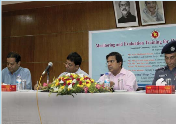
Guests are seen at Monitoring & Evaluation Training at Chittagong