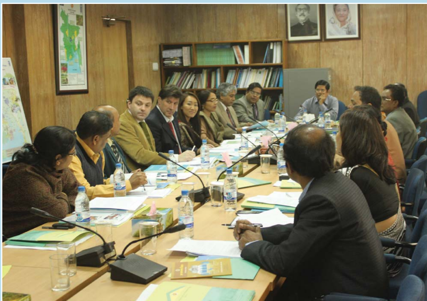
PSC Meeting is going on