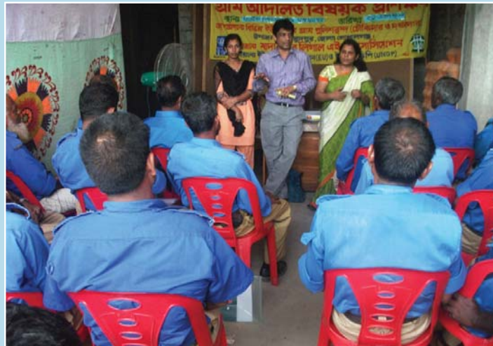
A reflection of Village Police Training on Village Courts