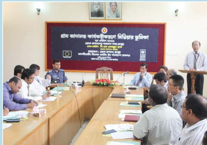
Media Workshop at Rangpur