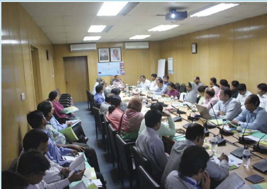
Interactive Workshop on Village Courts with Cabinet Division