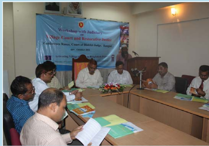
A section of the participants is seen at workshop with Judiciary on Village Courts