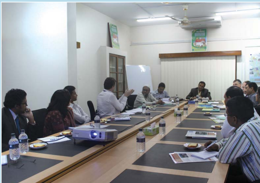
Coordination Meeting with PRP