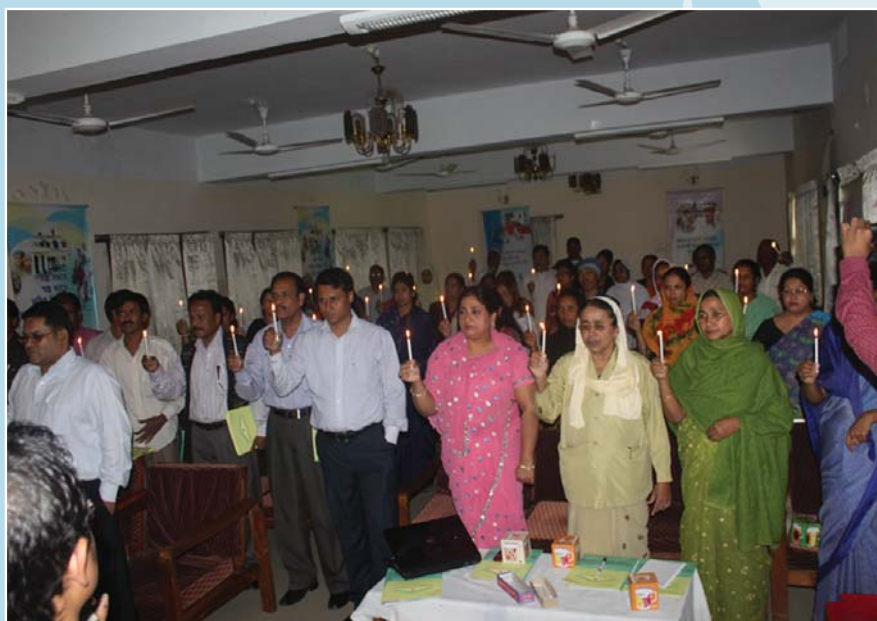
A reflection of the participants at Gender Workshop