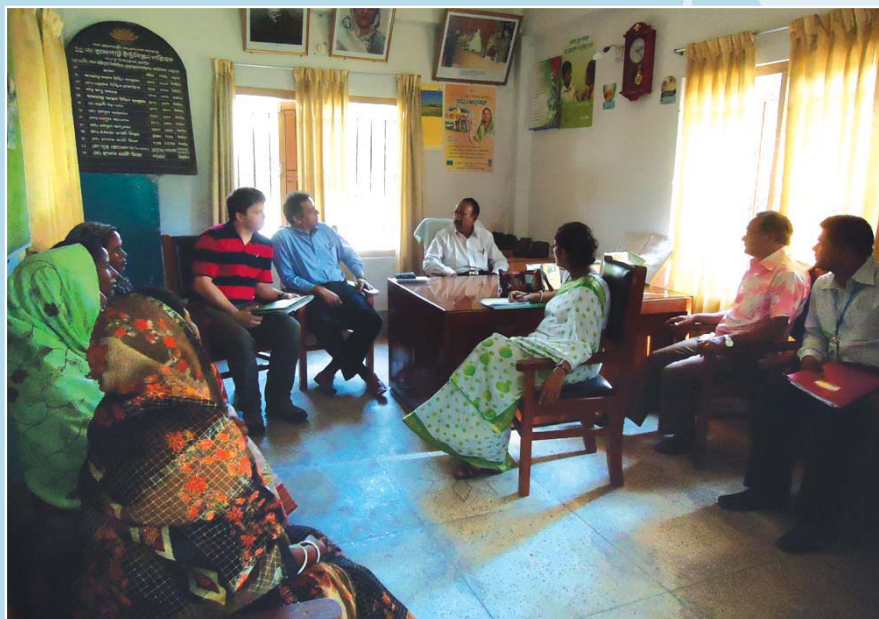
EU representative is visiting a Union Parishad at Rangpur