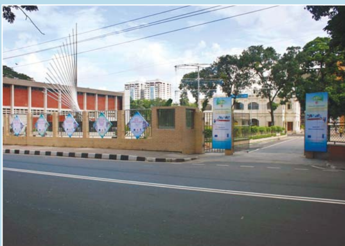
Colorful & informative Festoons at the venue of National Consultation on the 'Village Courts Act, 2006: Challenges and Way Forward' at Dhaka