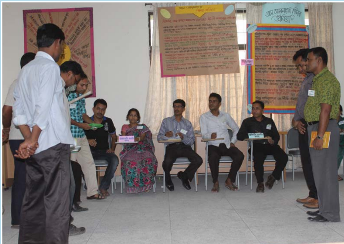
ToT Program on Village Courts