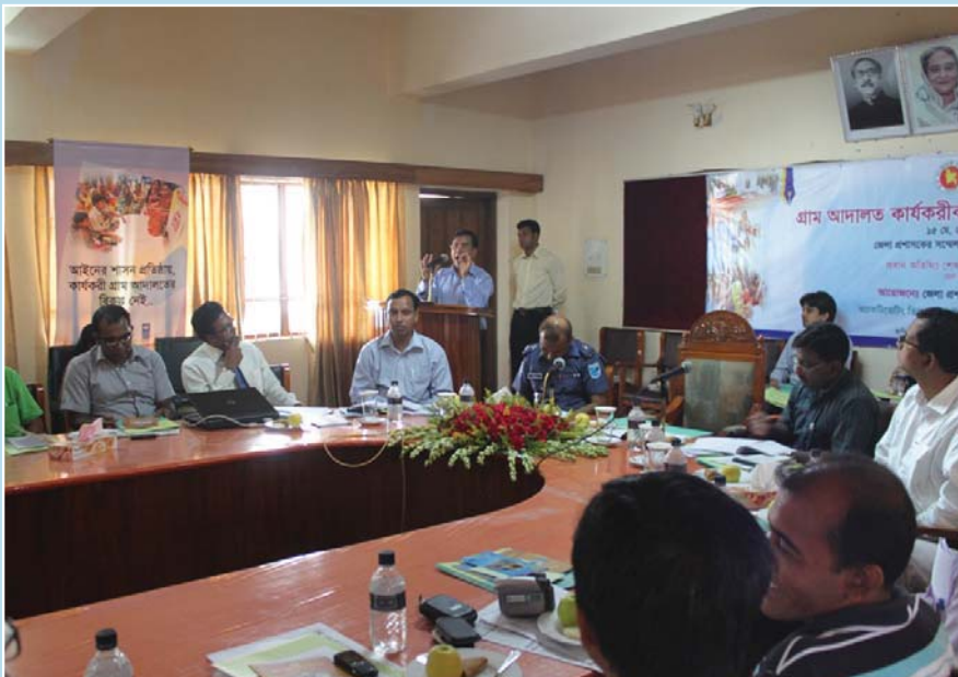
The DC is delivering speech at Media Workshop at Gopalganj