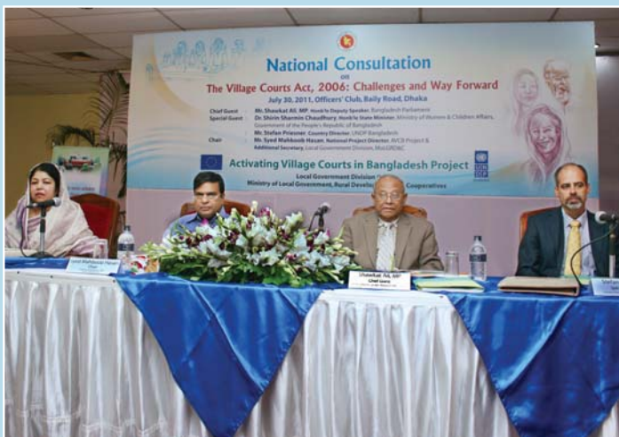
Guests are seen at National Consultation on the 'Village Courts Act, 2006: Challenges and Way Forward' at Dhaka