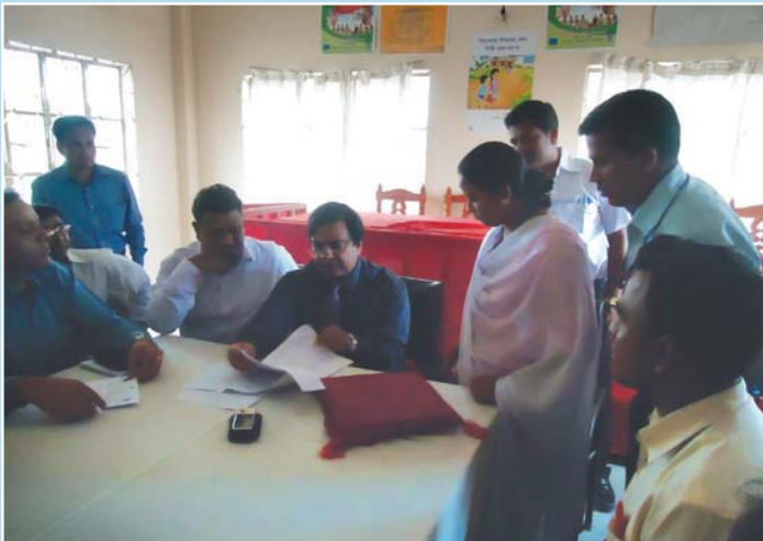
NPD visiting a Village Court & observing the documents at Rangpur