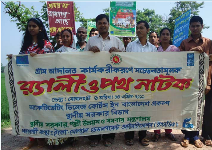
Rally on Village Courts at field Level