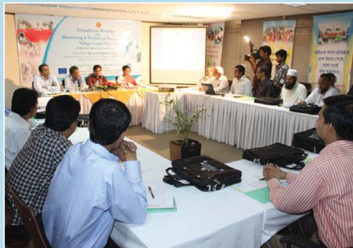
Workshop on Monitoring Framework on Village Courts Project at Dhaka