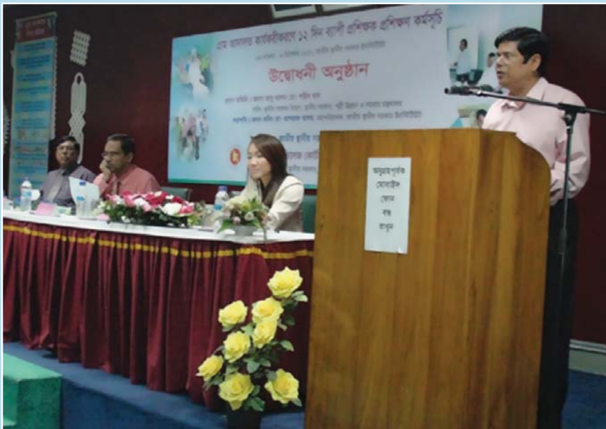
Inaugural session of ToT on Village Courts at Dhaka.