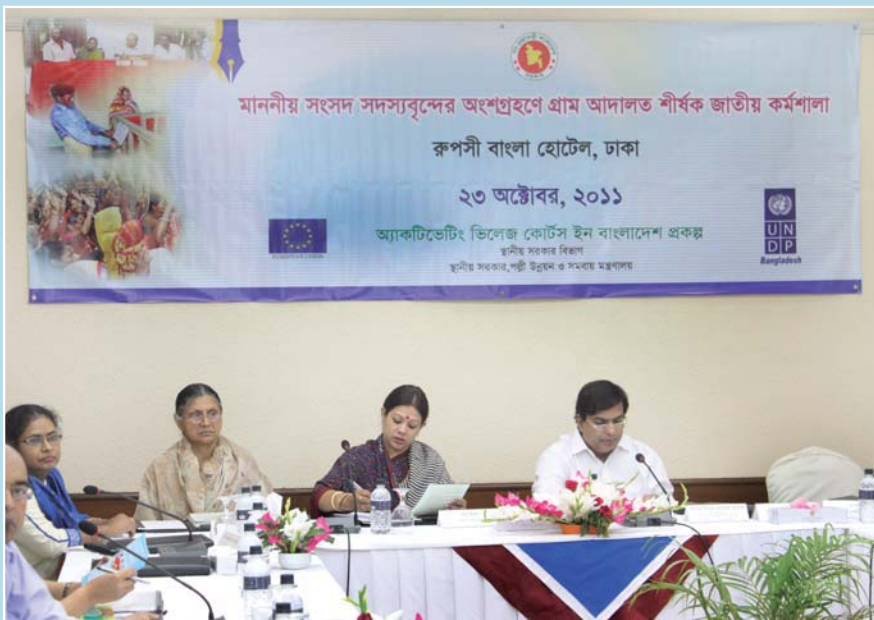
Workshop on Village Courts with MPs at Dhaka