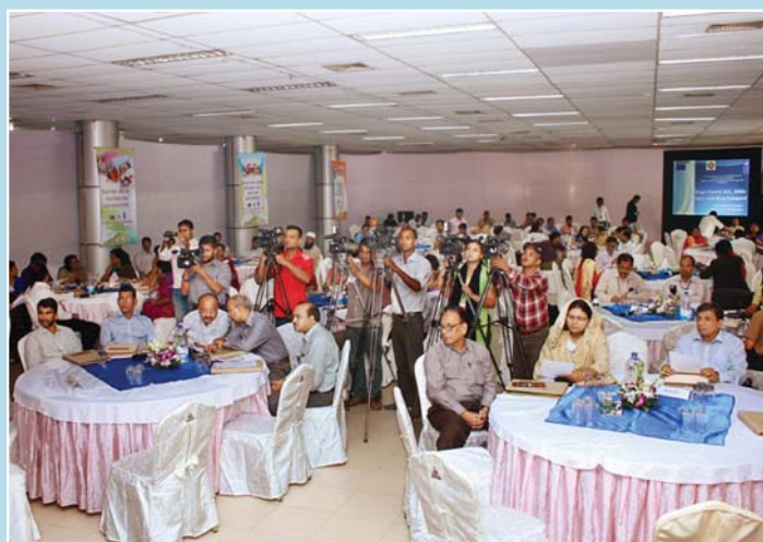
Media at National Consultation on the 'Village Courts Act, 2006: Challenges and Way Forward' at Dhaka