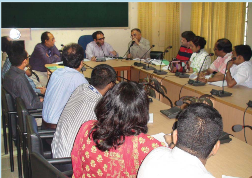
EU representative is participating at a meeting with Divisional Commissioner of Rangpur