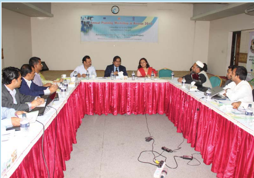
A reflection of "Annual Planning Workshop & Retreat of 2010" of AVCB at Jumuna Resort