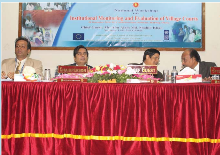
Guests are seen at workshop on Institutional Monitoring and Evaluation of Village Courts