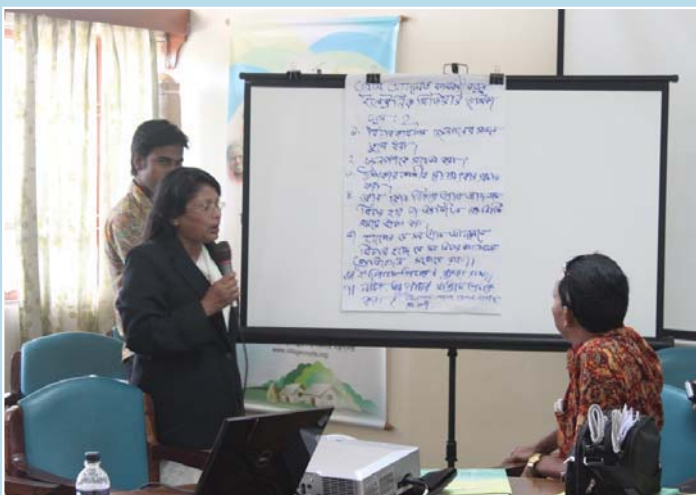
A Participant is presenting the findings of group work at Media Workshop