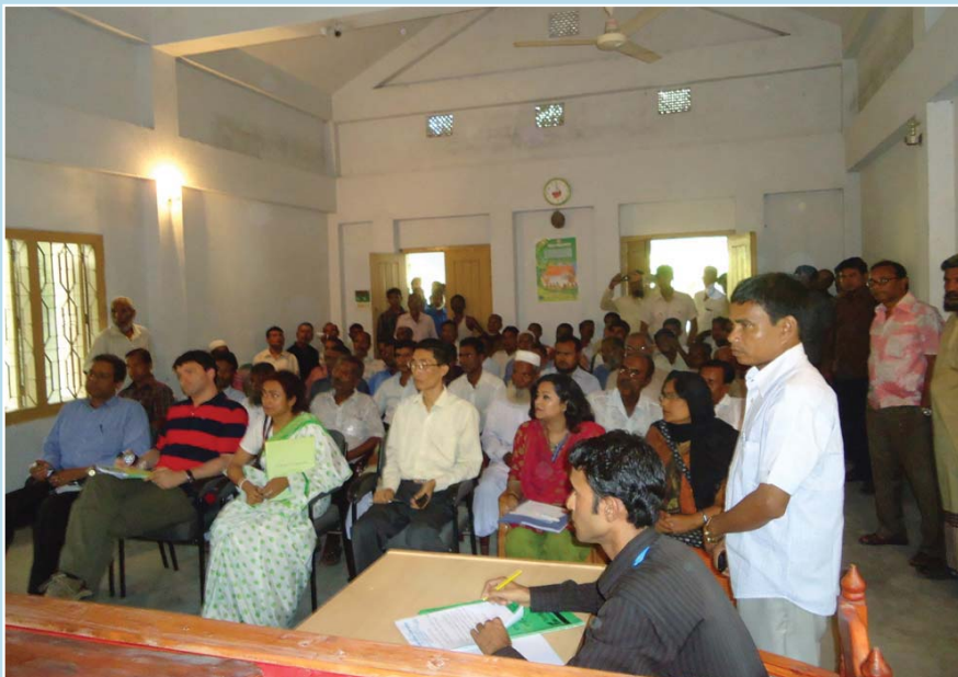
EU representative is observing a VC trial session at Rangpur