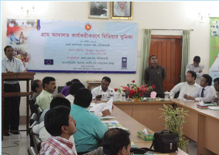
Media Workshop at Nilphamari