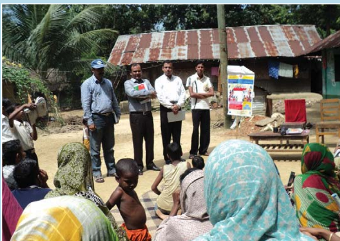
Monitoring Officer, AVCB is observing a Court Yard Meeting