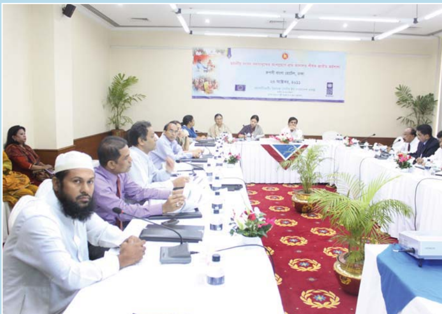
Guests are seen at workshop on Village Courts with MPs at Dhaka