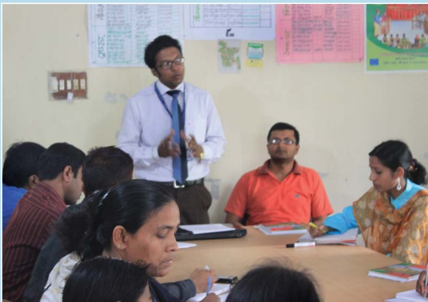
Communication Officer, AVCB Project is seen at Coordination Meeting with PNGO at Lalmonirhat