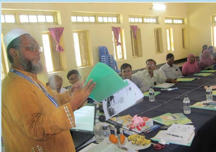
Legal Expert of AVCB is Conducting a session on legal issues on Village Courts at field level