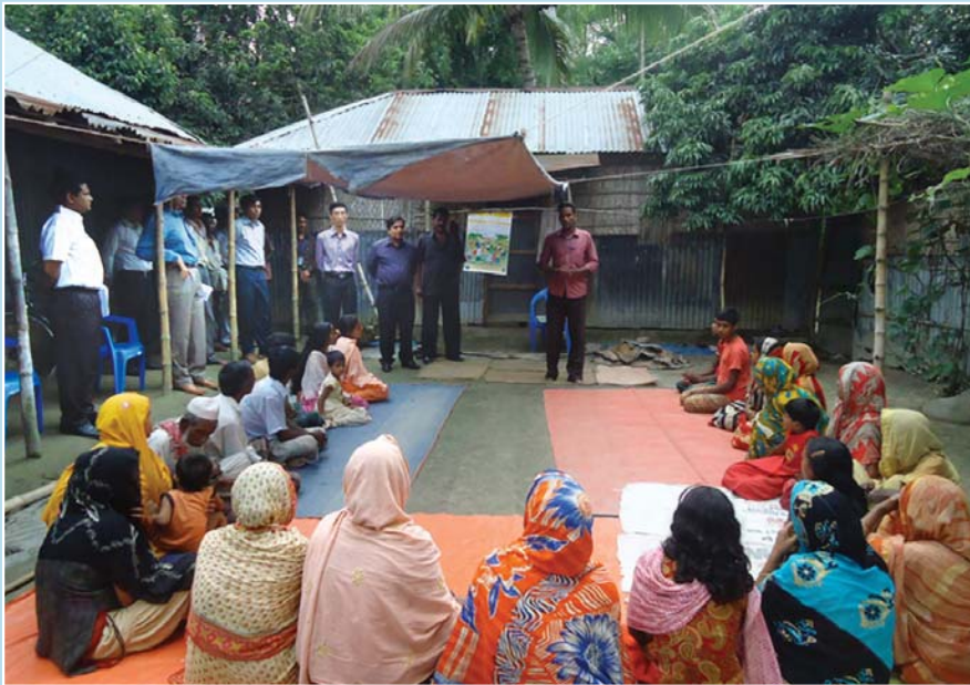
The NPD is visiting a Court Yard Meeting at Rangpur