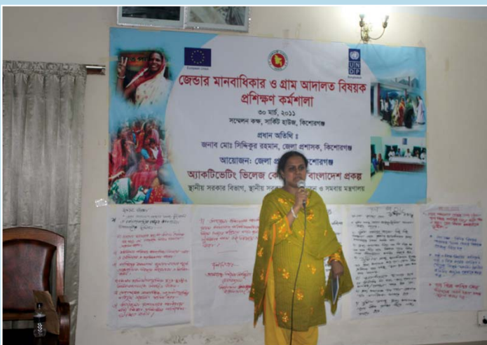
A participant of Gender Workshop sharing the findings of group work at Kishorgonj