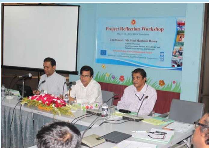
Reflection Workshop of Village Courts Project at Dhaka